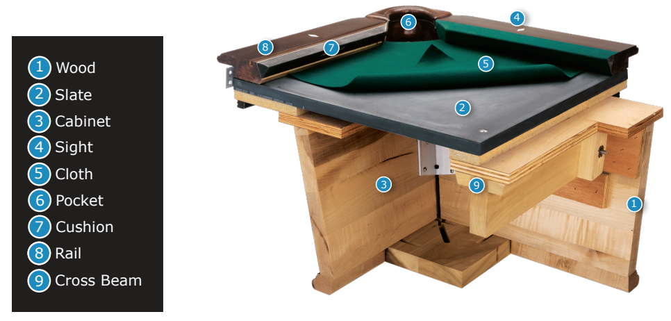
Diagram 2 – Parts of the Table